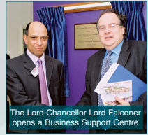
The Lord Chancellor Lord Falconer opens a Business Support Centre